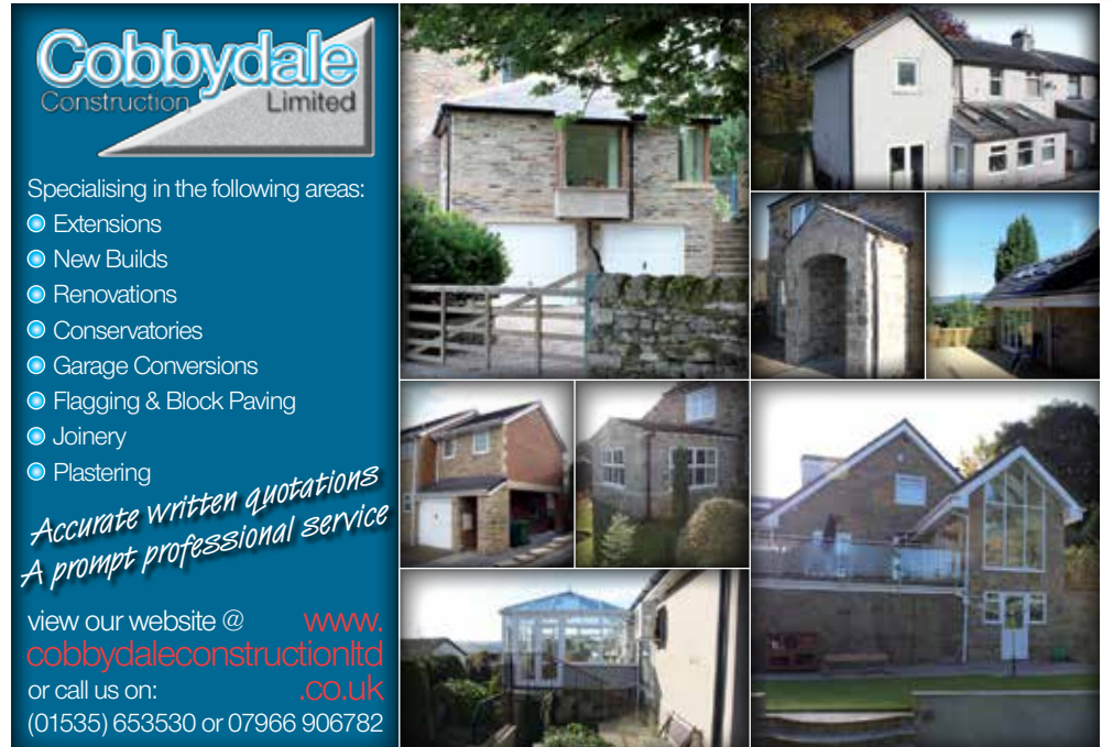
Say you saw it in the Aire Valley Mag!